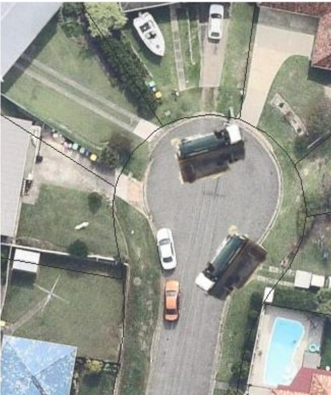
Figure 20 - Waste collection vehicles in cul-de-sacs and tight turns

In Figure 19, you can see in this narrow street development that the standard waste collection vehicles (9.7m) do not have sufficient room to turn without crossing kerbs into landscaped areas or even colliding with awnings, trees and building corners. There is also insufficient room to pass cars on the straights.