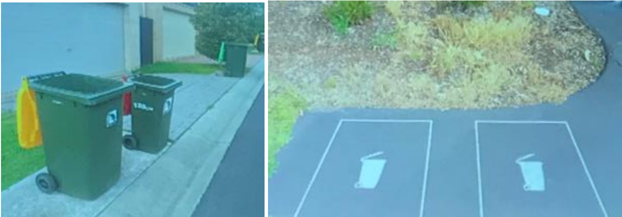
Figure 21 - Creating bin collection areas along the road side