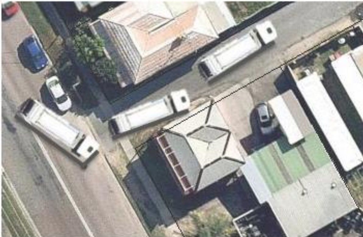
Figure 18 - Difficulties for turning trucks into narrow streets, especially with parked cars

If bins are to be collected from streets within a subdivision, the streets must not be too narrow, and corners must allow for the standard waste vehicle turn circles (see Appendix 2). Locations where cars will park must also be planned, as waste collection vehicles may not be able to turn or pass on curves or narrow straights.