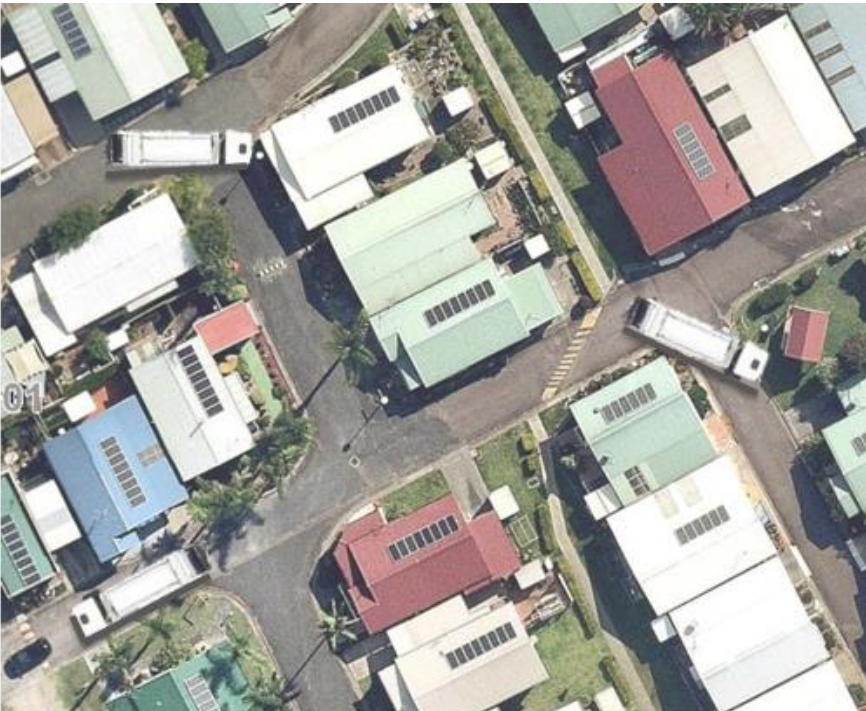
Figure 19 - Impossible to service narrow access roads with standard size waste collection vehicles

In Figure 19, you can see in this narrow street development that the standard waste collection vehicles (9.7m) do not have sufficient room to turn without crossing kerbs into landscaped areas or even colliding with awnings, trees and building corners. There is also insufficient room to pass cars on the straights.