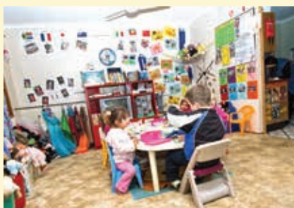
Children participating in Family day Care activities

Family Day Care Services do attract subsidies under the Child Care Benefit and Child Care Rebate entitlements, which some families are eligible to receive. Interested families are encouraged to contact the Family Assistance Office to see if they are eligible for subsidies.