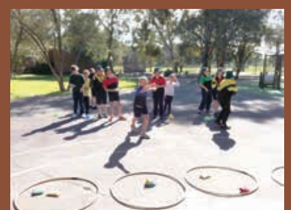
Children participating in Traditional Indigenous Games